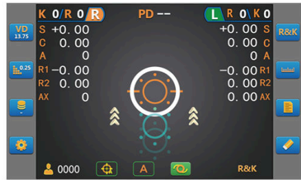
Auto tracking ( Y axis )

Adopt the ARM Cortex-A8 processor, which makes the measurement more faster and accurate. The touch screen provides friendly user interface, and makes the operation more convenient.